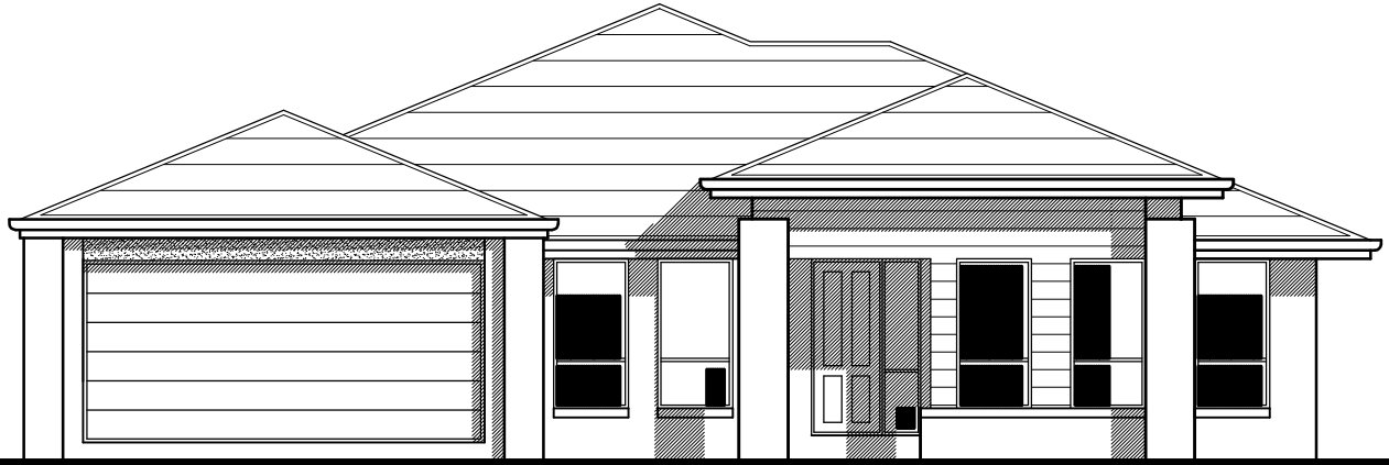
A. - STANDARD