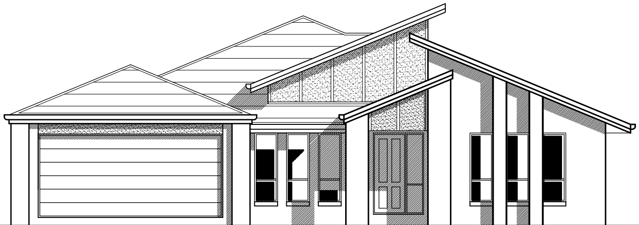
B. - OPTIONAL