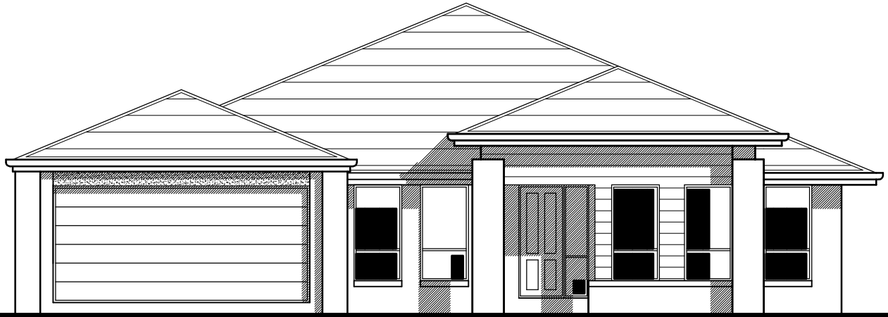
A. - STANDARD