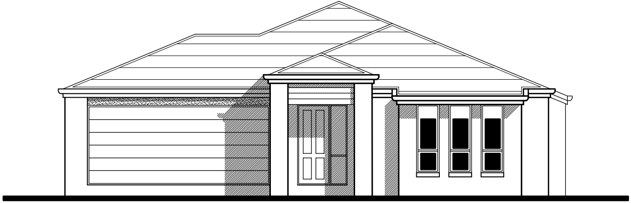
A. - STANDARD