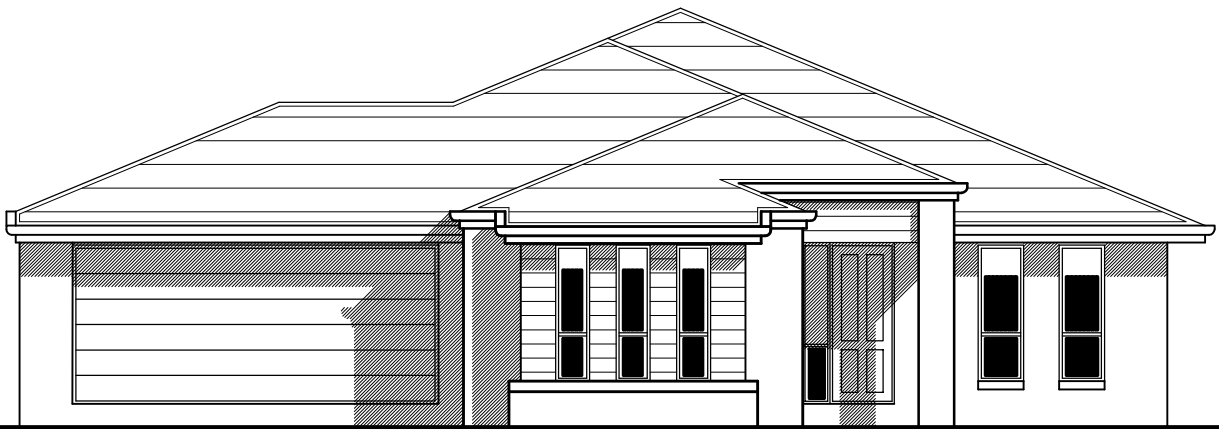
B. - OPTIONAL