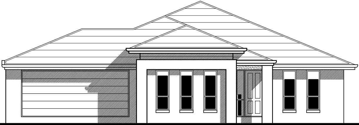
A. - STANDARD