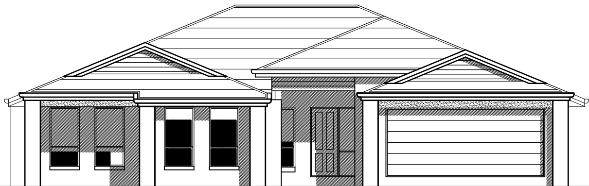
C. - OPTIONAL