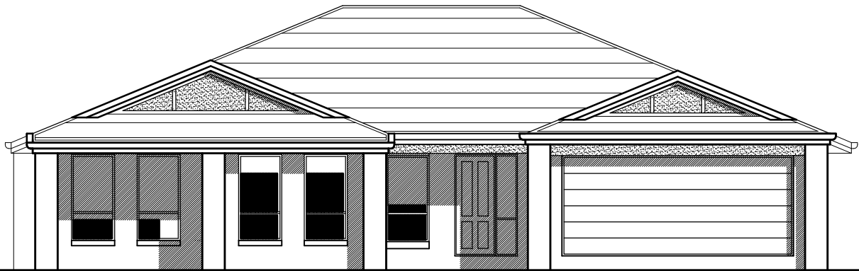
B. - OPTIONAL