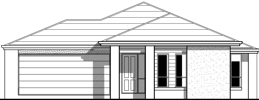
B. - OPTIONAL