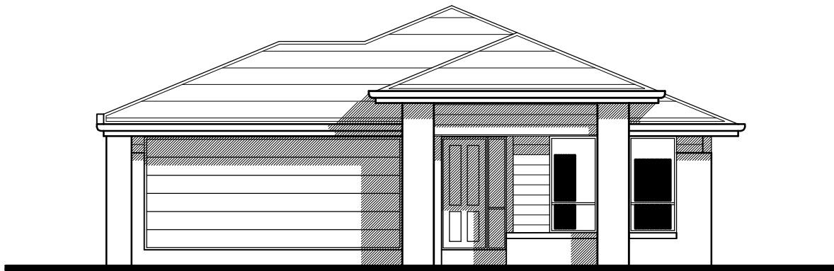
D. - OPTION