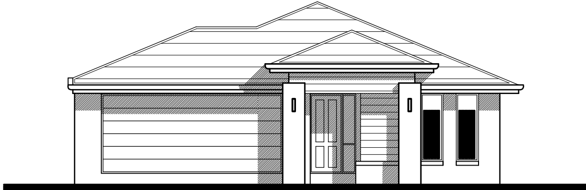
B. - OPTION