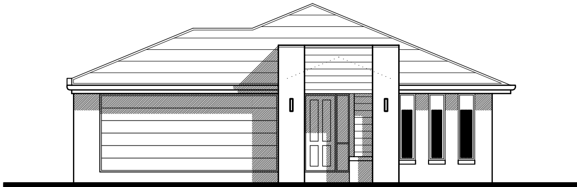
C. - OPTION