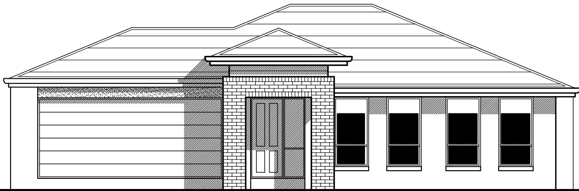
B. - OPTIONAL