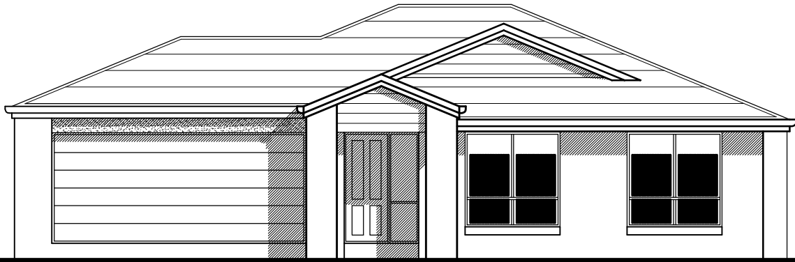
A. - STANDARD