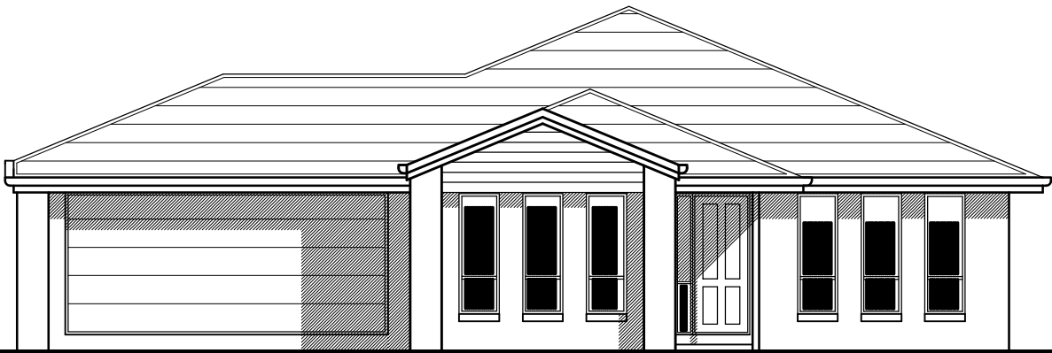
C. - OPTION