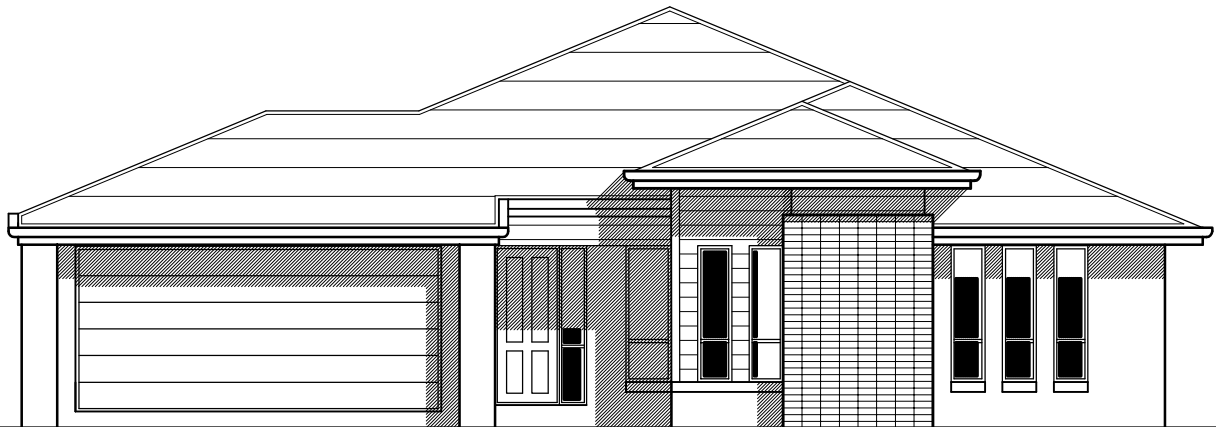
B. - OPTIONAL