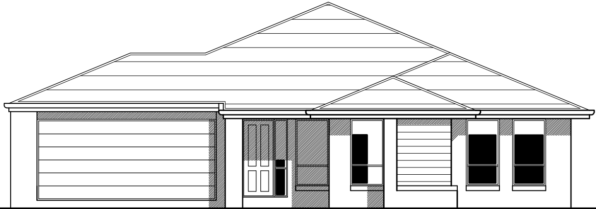
A. - STANDARD