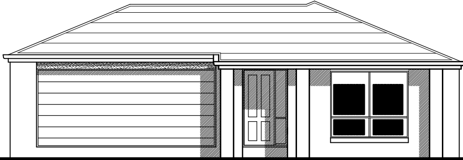
A. - STANDARD