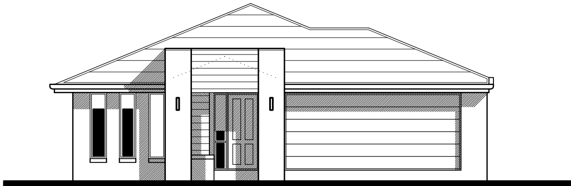
C. - OPTION