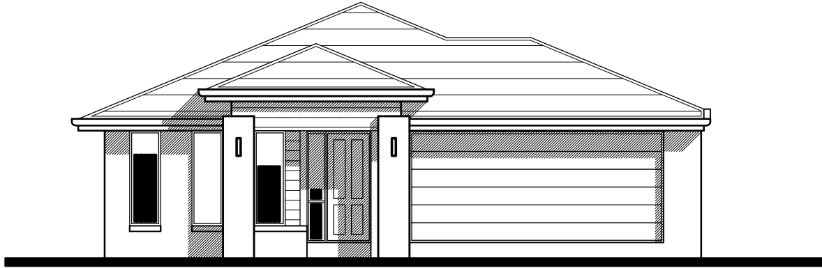
B. - OPTION