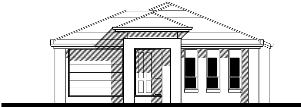
B. - OPTIONAL