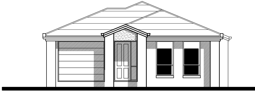
A. - STANDARD