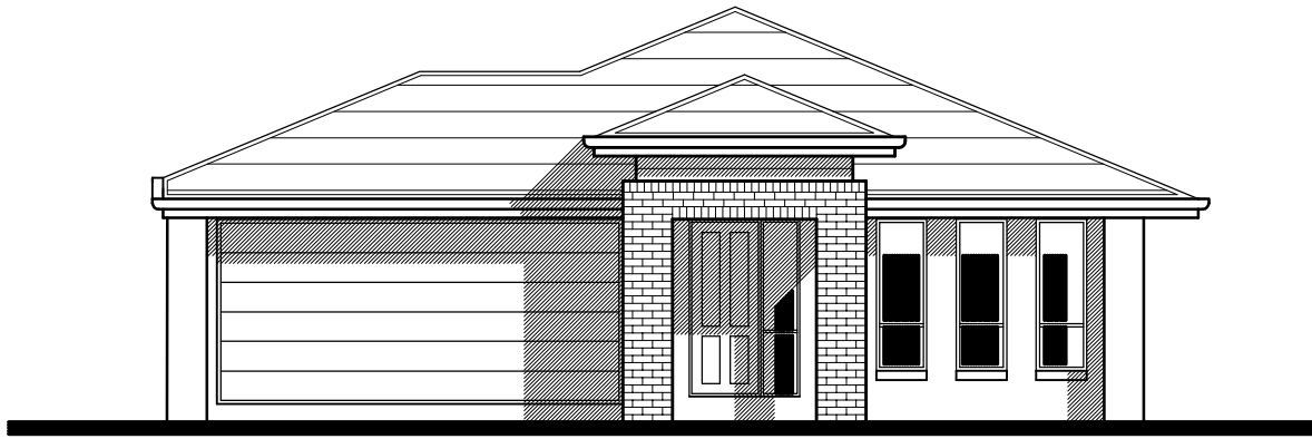
A. - STANDARD